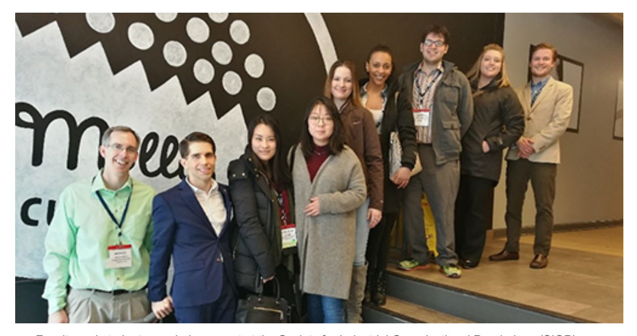
Faculty and students regularly present at the Society for Industrial Organizational Psychology (SIOP) annual conference.